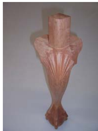
BALL & CLAW with Shell on the knee A two day skill-building project